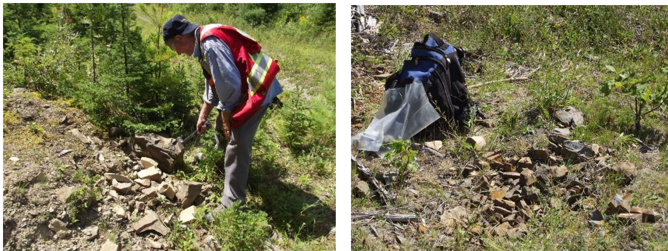
FIGURE 3: Rusty Pyritic Volcanics & Vesicular Rusty Volcanics exposed in southern area of Alba Forks